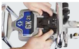
1 Open the access hatch