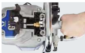
2 Remove the pump